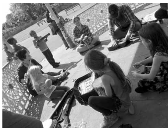
Workshops for people of all ages: children and adults playing music together.